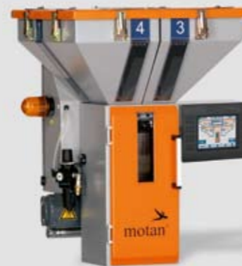
GRAVICOLOR 30 MD